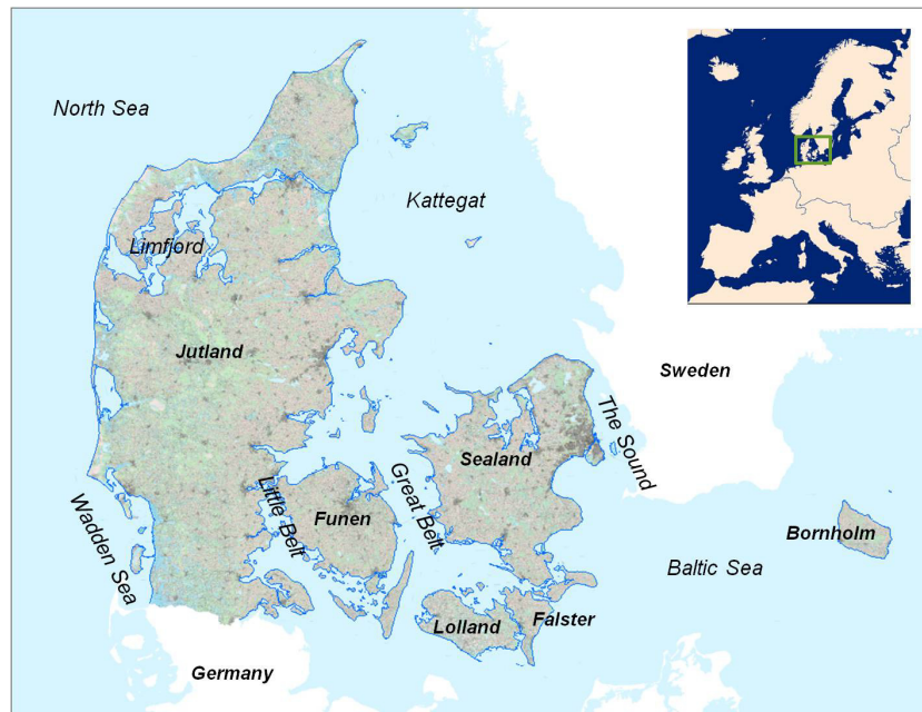
Figure 1. Map of Denmark and surrounding waters.

DVR90 datum \approx Mean Sea Level in 1990) in the Wadden Sea, 3-3.5 m along the North Sea coast, and 1.5-2.0 m elsewhere in the Danish waters (Sorensen, Madsen and Knudsen, 2013). Storm surges mainly occur during winter (October – March) from eastward travelling atmospheric lows that force water onto the North Sea coast and into the Kattegat area. Only on rare occasions like the 1872 Baltic storm surge where water levels exceeded 3 m, are travelling lows from an easterly direction observed. The flooding hazards vary between the different water compartments and the country is confronted with two different overall storm surge scenarios originating in the North Sea and Baltic Sea, respectively. Accordingly, the risk varies across the country. On the North Sea coast and in the Wadden Sea areas extensive flooding and erosion protection schemes have been carried out over the past century. The protection levels are fairly high but the areas are not very developed, however. In the middle parts are many low-lying coastal towns and holiday houses, and many port areas have recently transformed into fashionable housing and office spaces. Along the Baltic Sea coast the probability of flooding may not be high, but large urban developments in connection with the capital of Copenhagen have occurred in flood-prone areas. About 80% of the Danish population lives less than three kilometers from the coast (Olesen, 2008).